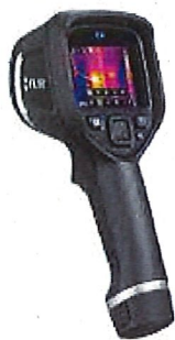
This is a FLIR thermal imaging camera model E4 1.2L